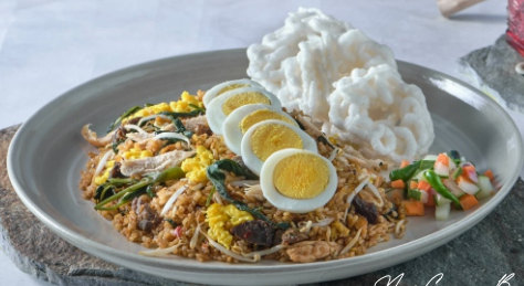
Nasi Goreng Branche

The most favorite dish from one of our Chef's signature oxtail soup with diced carrot and potatoes. Served with steamed rice, melinjo crackers and spicy chili paste